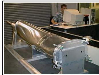
Complex Ducting Assembly Forming - Aluminum Welding Tube Bending - Assembly