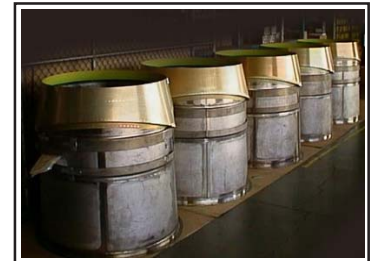
Exotic Metal Forming Complete Assembly X-Ray Quality Welds - Machining