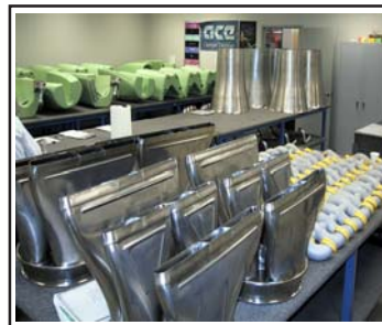
Multi-Discipline Assemblies Forming - Spinning - Bending Welding - Machining

In February of 2012 a 9 Ft. Faro Arm was purchased to allow for portable inspection of form dies, and large assemblies without disrupting production flow. 2 New Drop Hammers have been installed to address capacity issues at the metal forming facility. 6 New Large Machining Centers were purchased from 2006 to 2012 bringing more in-house control to our tooling and machine shop. Additionally a New 5-Axis Laser was acquired in 2011.